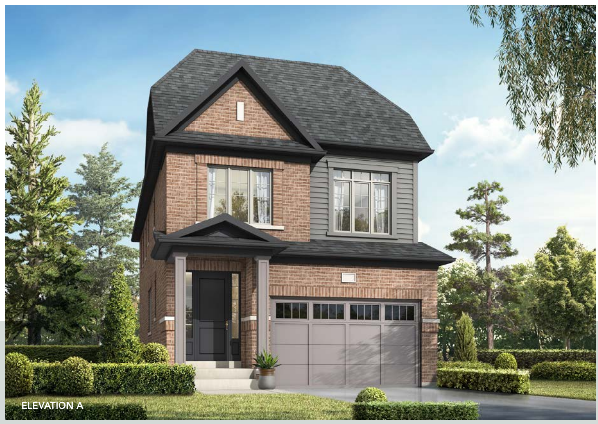
ELEV A, B & C : 2,202 SQ. FT.