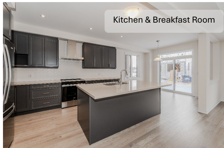
Kitchen & Breakfast Room