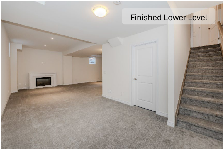
Finished Lower Level