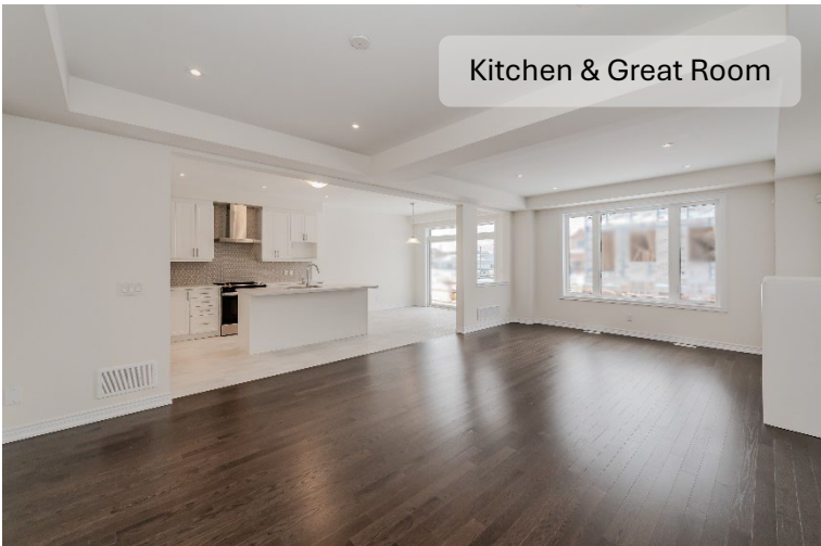
Kitchen & Great Room