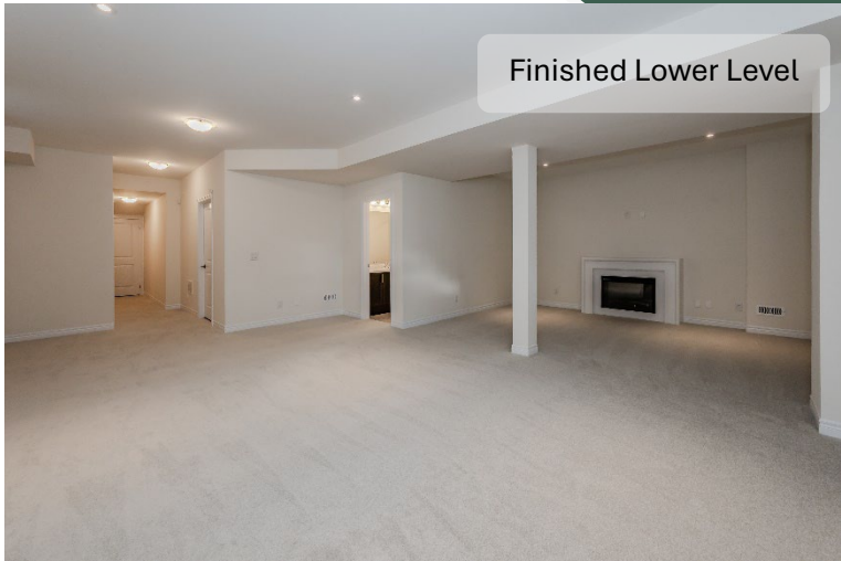
Finished Lower Level