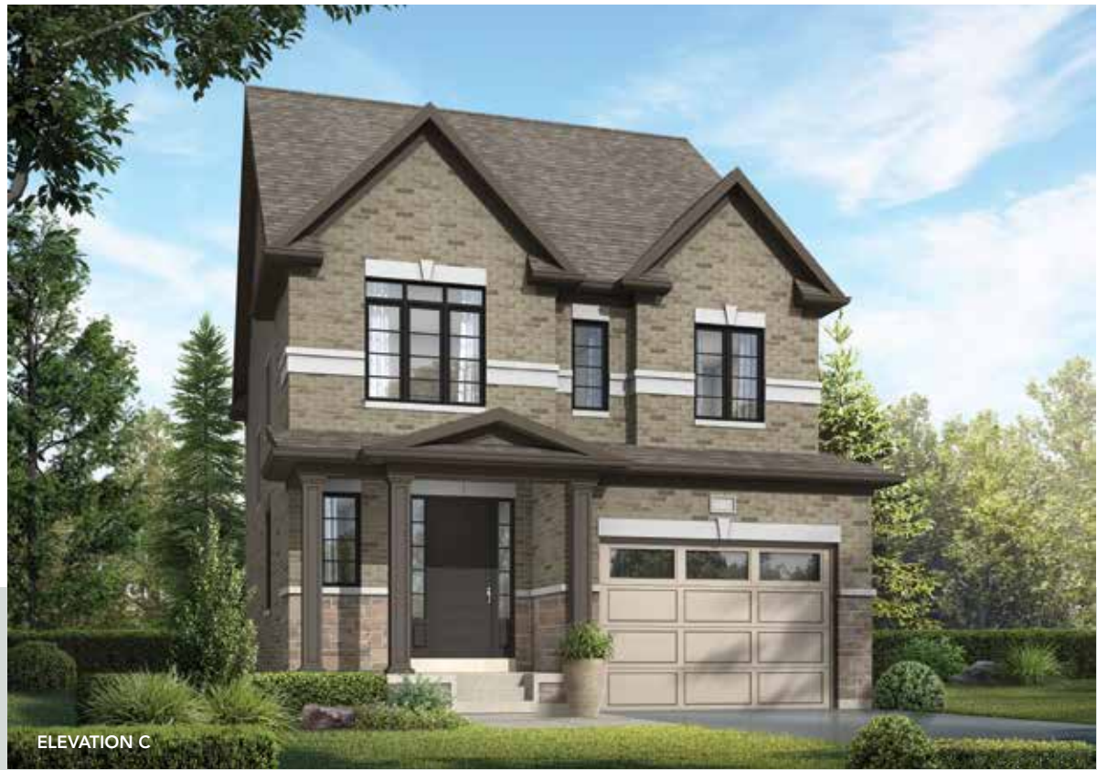
ELEV A: 2,492 SQ. FT. / ELEV B & C: 2,496 SQ. FT. INCLUDING 437 SQ. FT. OF FINISHED LOWER LEVEL