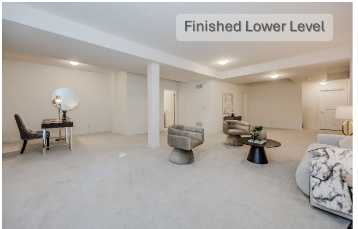
Finished Lower Level