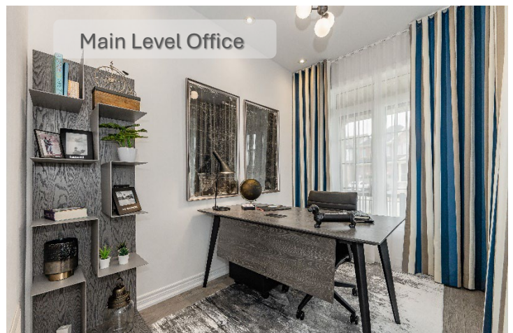
Main Level Office