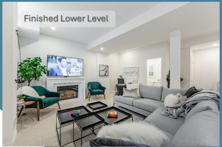
Finished Lower Level