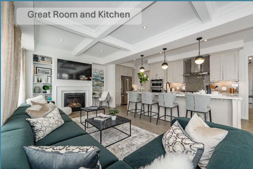
Great Room and Kitchen